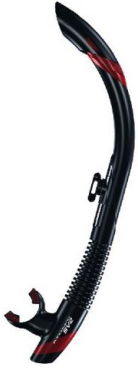
Atomic Aquatics SV2 Snorkel